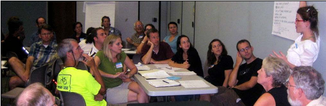
A citizen at the Baton Rouge public meeting shares her group's concerns about biking in Baton Rouge.

Participation at the meetings was higher than expected, nearly reaching that of the LDOTD Statewide Transportation Plan, despite the fact that no paid advertising was used to promote the meetings. Outreach efforts focused on active citizen groups, transportation planning committees, and bicycle and pedestrian advocacy groups. The public meeting format included a brief presentation on the Statewide Bicycle and Pedestrian Plan, followed by a participatory planning exercise where groups identified their concerns for walking or biking, then solutions were discussed.