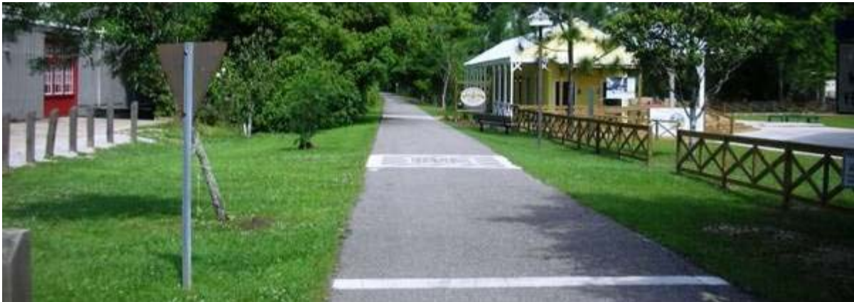
The Tammany Trace in downtown Abita Springs.

The second category, provision of safety education activities, is for the purpose of developing training, information and/or encouragement programs. One example of this type of project is the 'Lafayette Pre-teen Peddlers', which received $142,000 in 2000. The eighth category, preservation of abandoned railway corridors can be used for rails to trails conversions. One of the first TEP projects in Louisiana, the Tammany Trace in St. Tammany Parish, received over $1.6 million in 1992.