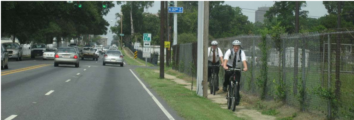
Two bicyclists ride on the narrow and overgrown sidewalk rather than risk riding with traffic on Florida Blvd (LA 61).

From 19 th to 22 nd Streets, there are cemeteries located on both sides of the roadway. This provides a well managed corridor in terms of access management, however the narrow sidewalks and nearly absent buffer area make walking this portion of the corridor uncomfortable, as there are either walls or fences immediately adjacent to the sidewalk. The Capital Area Transit downtown terminal is located at the corner of 22 nd Street, and the Baton Rouge General Medical Center is located between N. Acadian Thruway and Peachtree Boulevard.