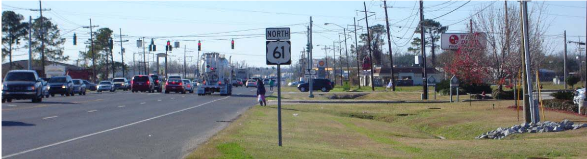
One pedestrian waits to cross Airline mid-block in front of Wal-Mart while another waits (in the distance) at the Belle Terre (LA 3188) intersection.

This section of Airline Highway is characterized as an Urban Principal Arterial, having an ADT of 33,200 vehicles. There are four 12ft travel lanes, with 10ft shoulders and a 13ft center turn lane in this section of highway. The width of the apparent Right of Way (ROW) is 150ft, and there is open drainage. There are no sidewalks and there are no sidewalks, marked crosswalks or other pedestrian facilities.