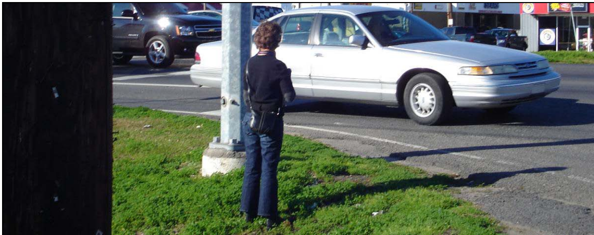
A pedestrian waits on the downslope of a drainage swale to cross Airline (US 61) at Hemlock (LA 3224) in Laplace, LA.