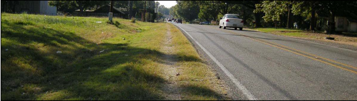
A 'goat trail' shows the pedestrian desire line on LA 838/New Natchitoches Road near Riser Junior High School in Monroe, LA